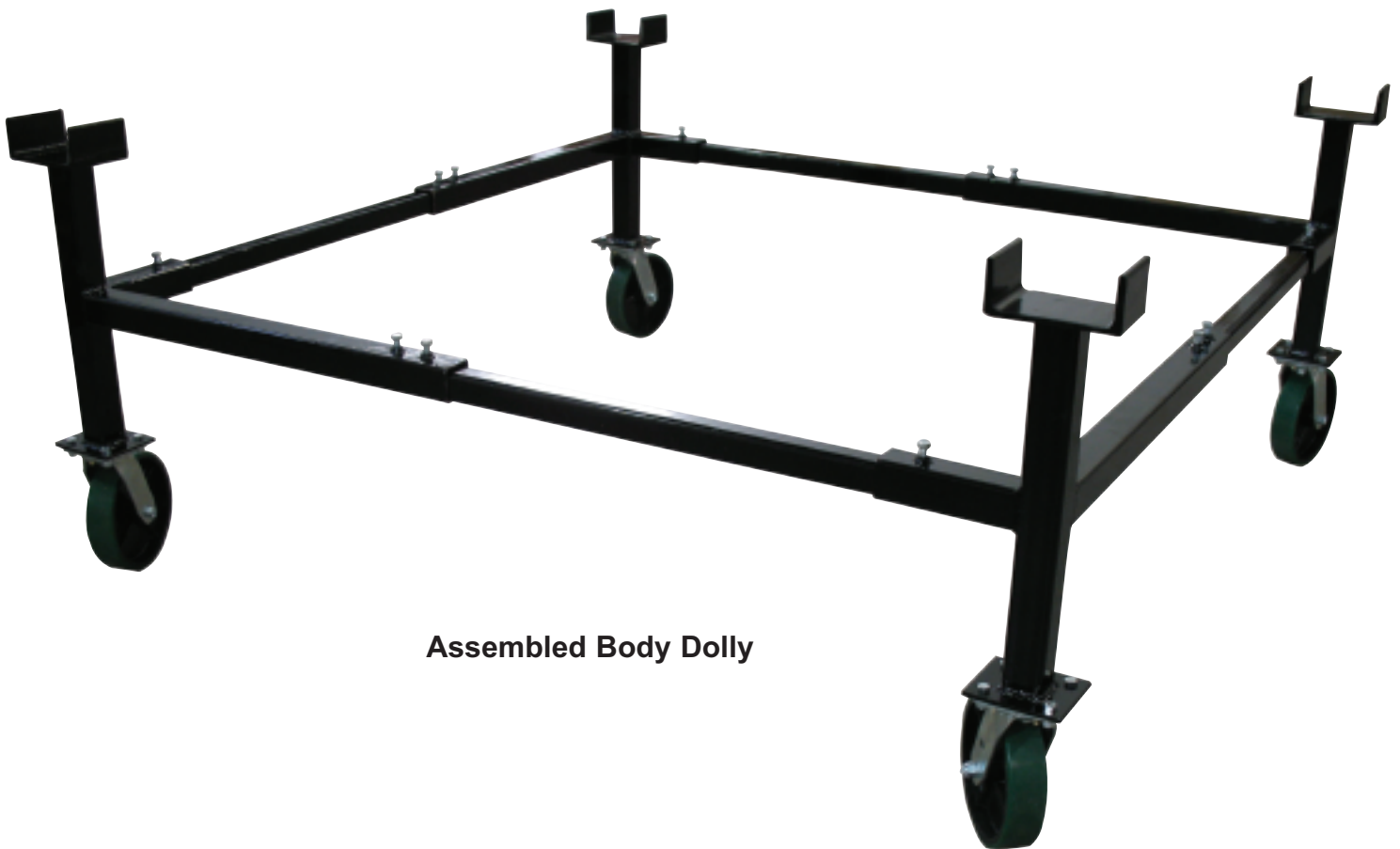
Assembled Body Dolly

Adjust Dolly to desired width by sliding extension arms in or out and then securely tightening the locking bolts. For safety reasons NO RED PAINT should be showing on the Extension Arms. If red paint is visible then slide bracket into the the Corner support arm until it is no longer showing.