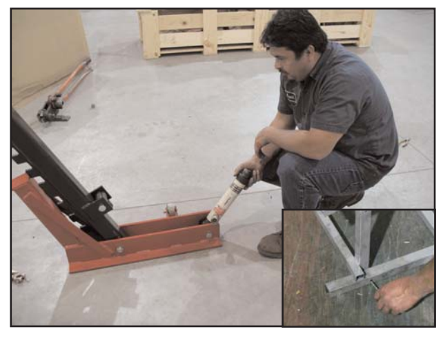
Screw hydraulic ram onto ram coupler at end of base. Hydraulic ram may or may not be included depending on which package you buy.