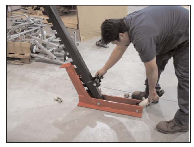
Remove bolt from ram coupler on post.c