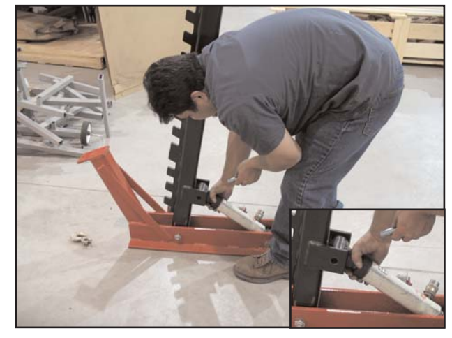
Attach ram coupler to post using supplied nut & bolt.