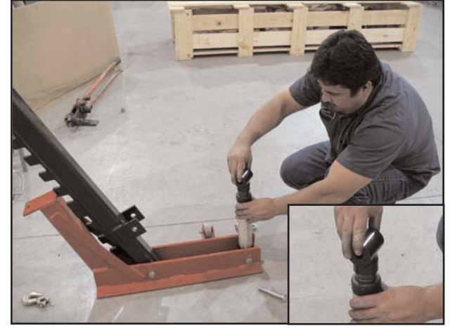
Screw ram coupler onto top of hydraulic ram.