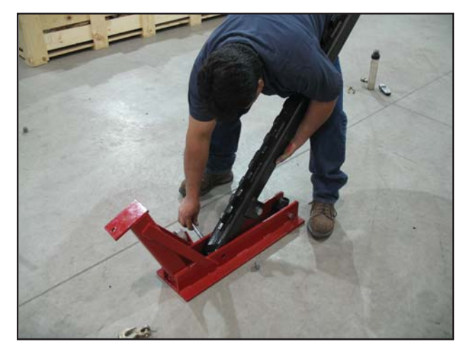
Attach post to base using supplied nut & bolt.