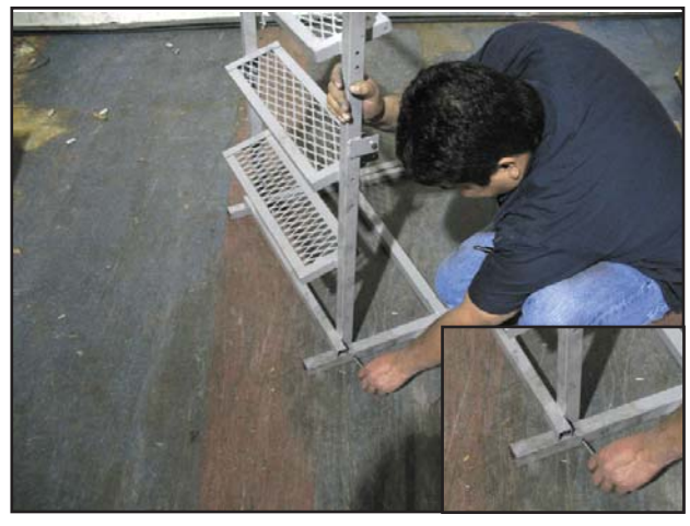
Insert the bolt on each side into the aligned holes and tighten the nut. Repeat for other side.