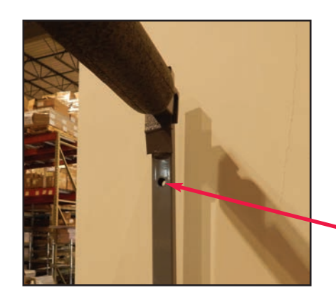
4. Level out the wall brackets and screw to the wall. (Screws not included)