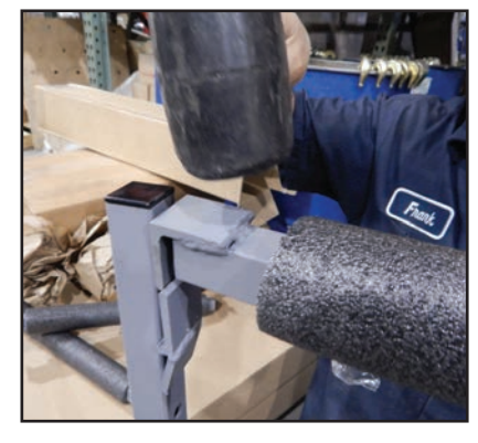
2. Using a rubber mallet, gently tap the metal tab of long arm in to the top slot of the wall mounting bracket.