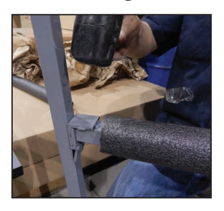
3. Repeat this step placing the tab of the short arm in the middle slot of the wall mounting bracket, and the remaining long arm in the bottom slot. Do these 3 steps with both wall brackets.