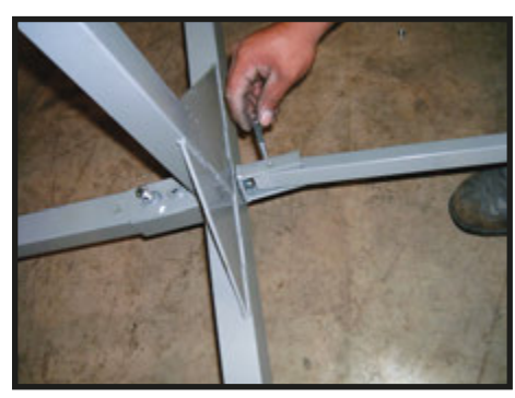
Attach Handle Bracket to Support Base. Handle can go on either side of Dually Bed Dolly. Attach Handle to Bracket.