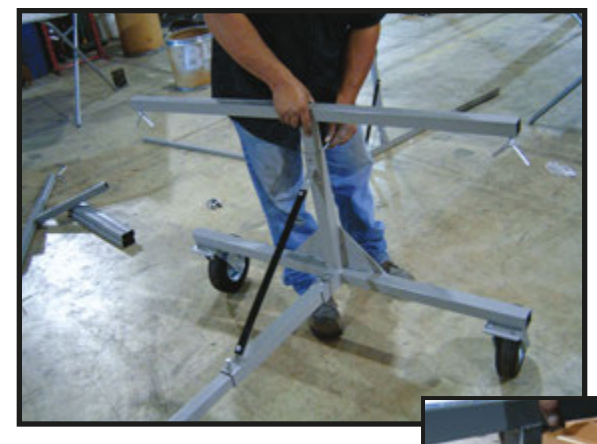
Slide Bed Support into Vertical Base Support.