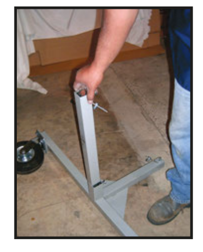
Attach Vertical Base Supports to Support Bases. They can be tightened into place with the lock bolts.