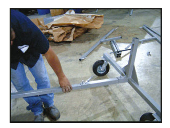
3. Attach Support Crossmember to both Support Bases.