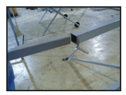
Slide Bed Support Extensions into ends of Bed Supports. These are adjustable by sliding in & out. Lock into place with the Lock Wing Bolts.