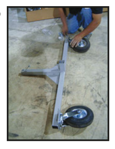
Attach large caster wheels to both Support Bases with included nuts bolts & washers