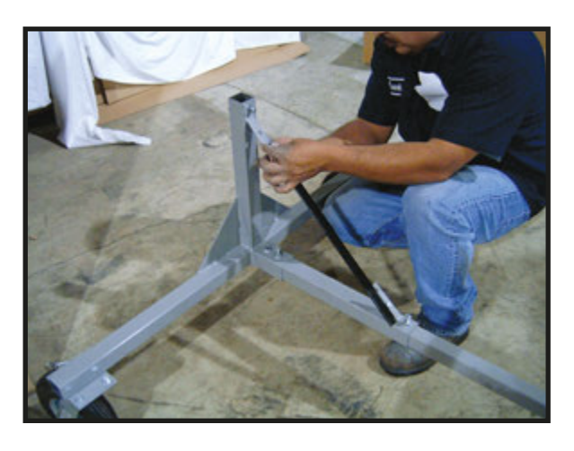
Attach Base Support Bracket to Vertical Base Support & Support Crossmember. Repeat for both sides.