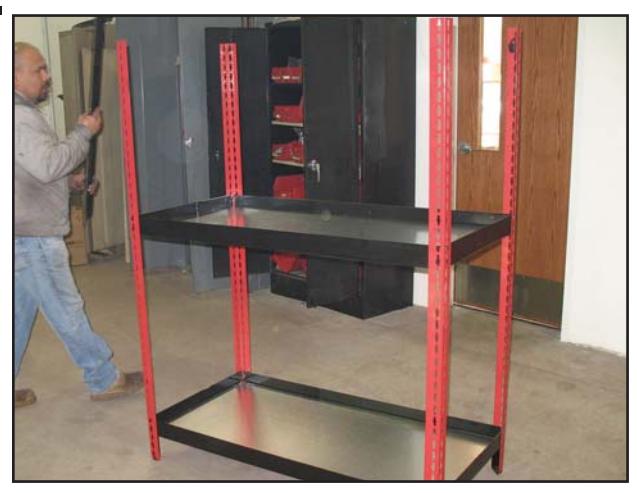
Insert the last 4 Cross Beams at the top of the Corner Supports to finish of the Frame of your Deluxe Parts Station.