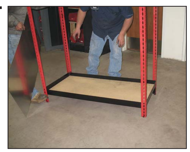
Insert Wooden Shelf into the bottom of the Deluxe Parts Station.