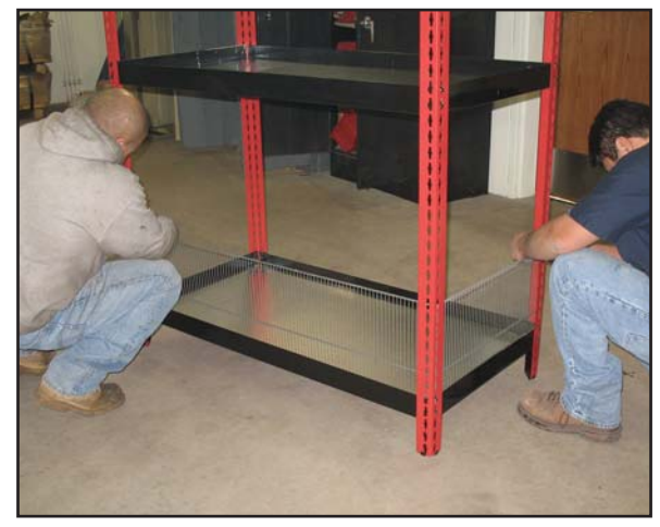
If you purchased model with fencing, insert the 4 fencing pieces into the bottom shelf. Otherwise move to next page.