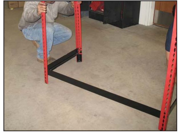
Work your way around the Deluxe Parts Station inserting cross beams into the corner uprights as shown above.