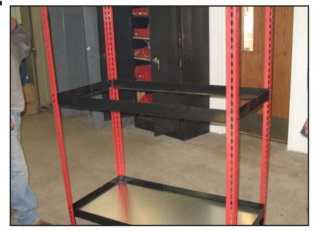
Work your way around all 4 sides on the Deluxe Parts Station inserting cross beams until you have all 4 sides done as above.