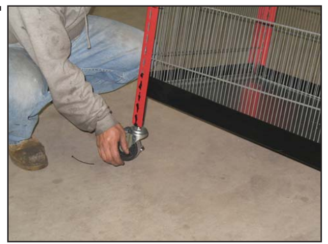
Carefully lift each corner of the unit and screw each Caster onto the bottom of each Corner Upright