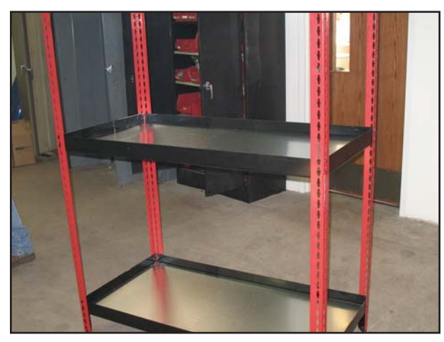
Insert Wooden Shelf into the Cross Beams as was done for the lower shelf. Place Metal Shelf on the Wood Shelf. (Metal shelf only for 1050-M & 1050-MF models)