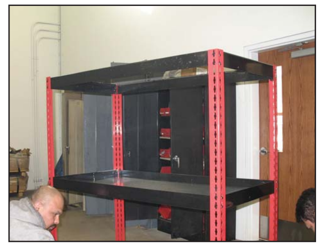
Top of Deluxe Parts Station should appear as above when finished inserting Cross Beams