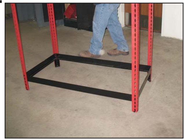
You should now have 2 long and 2 short cross beams inserted into all 4 corner uprights as shown above.