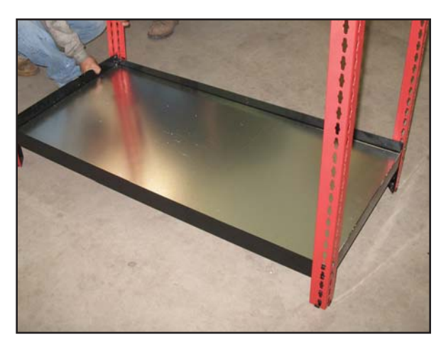
Place Metal Shelf on top of the Wooden Shelf. You are now finished with the bottom shelf section.