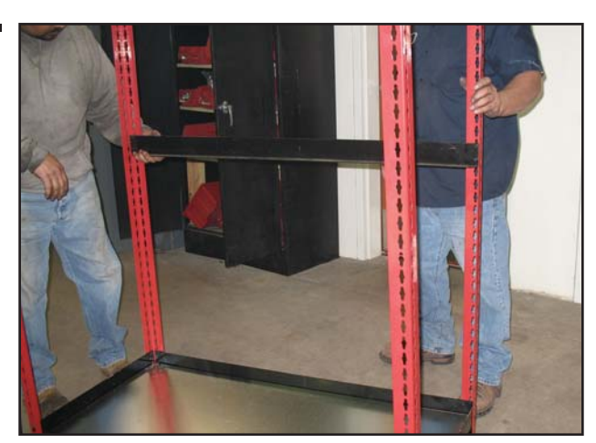
Insert Cross Beams into the Corner Uprights at the middle of the Corner Upright (or desired location) for the second shelf the same way you did for the bottom shelf.