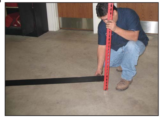
Insert long cross beam into corner upright.