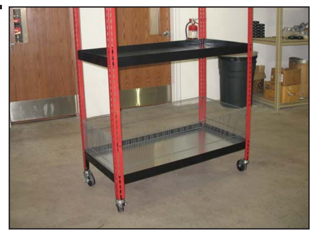
Insert all 4 caster until all corner uprights are done as shown above.