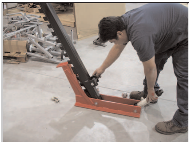
Remove bolt from ram coupler on post.c