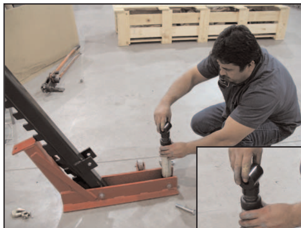
Screw ram coupler onto top of hydraulic ram.