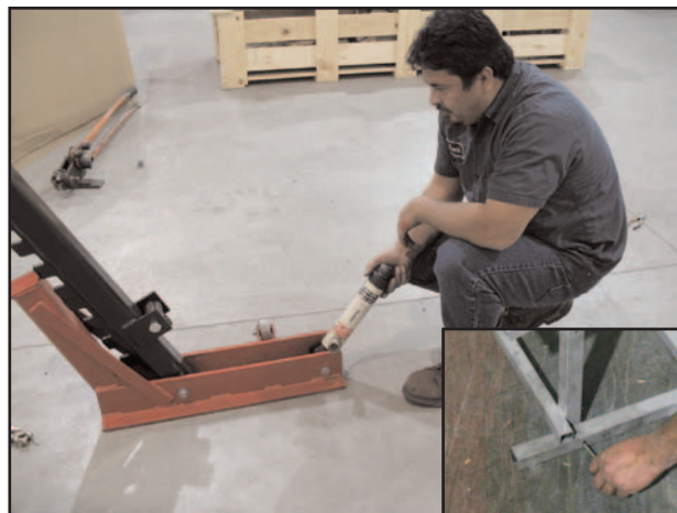
Screw hydraulic ram onto ram coupler at end of base. Hydraulic ram may or may not be included depending on which package you buy.