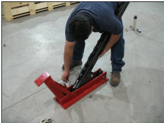
Attach post to base using supplied nut & bolt.