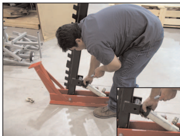
Attach ram coupler to post using supplied nut & bolt.