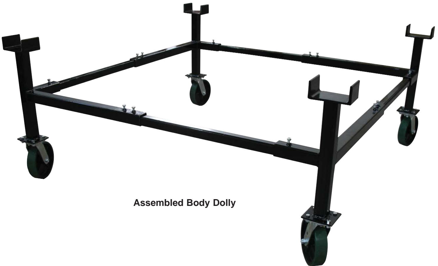
Assembled Body Dolly

Auto Body Toolmart Champ Frame Straightening Equipment, Inc. 2545 Millennium Dr. Elgin, IL 60124 (800) 382-1200 www.autobodytoolmart.com