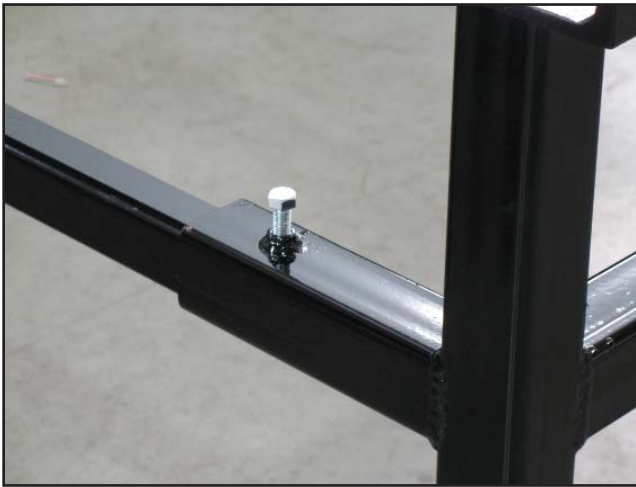
Screw locking bolts into threaded holes on Corner Brackets.