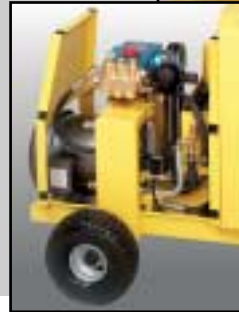
Pump and Water System