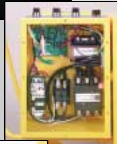
Electrical Junction Box