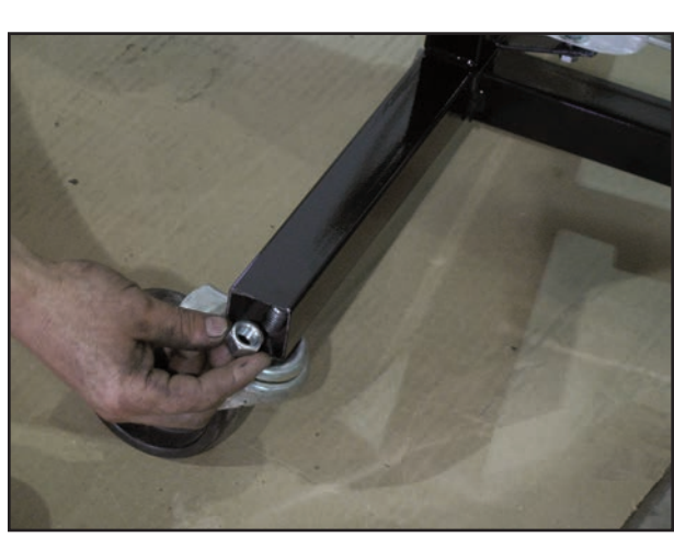
Carefully lift ends of Frame Structure (A) and slide Wheel (F) through provided hole in bottom of Frame Structure (A). Fully tighten with locking washer and nut. Repeat on all 4 corners.