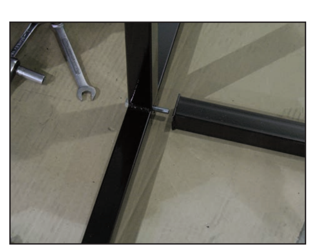
Attach straight bar of the Frame Structure (A) with 3" bolt (B)