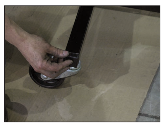
Place End Caps (G) on end of Frame Structure (A). Repeat on each corner.