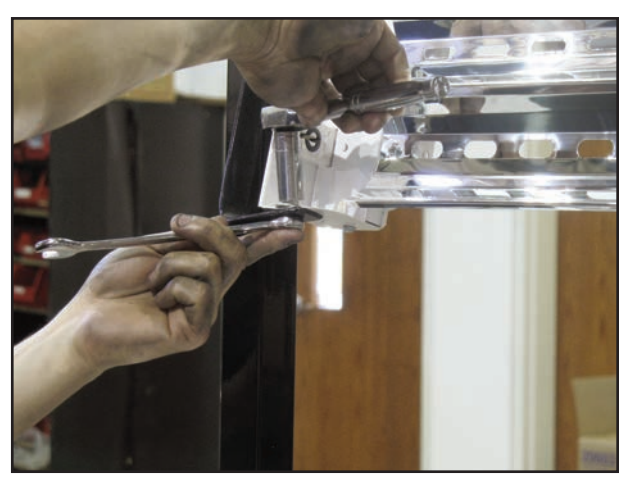
Fully tighten all nuts on brackets (included and already pre-assembled) on Light Housings (C).