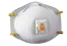
3M™ Particulate Respirator N95 PN 07185