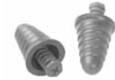
3M™ E-A-R™ Skull Screws™ Ear Plug, PN P1300