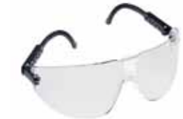
3M™ Lexa™ Protective Eyewear, PN 15200