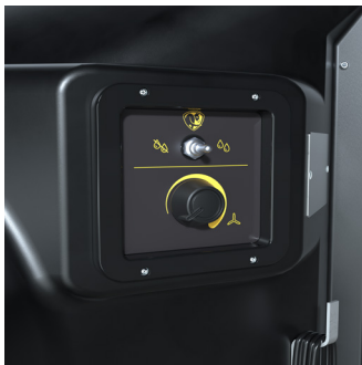
Onboard Variable Speed Control